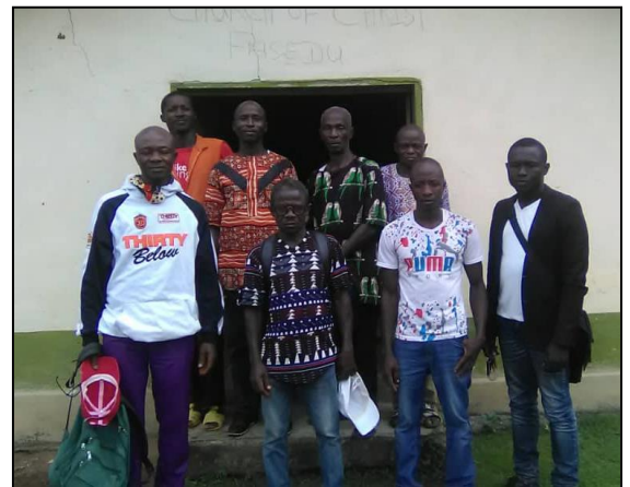
Meeting with local church preachers.

By God's grace and mercy, the church continues to grow through the Bible school construction and "other ministry expansion such as seminars, fellowships, radio programs, (and) youth agricultural projects in cooperation with other congregations in the district and country as a whole".