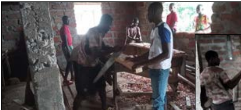
Making benches for the classroom.