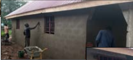
Finishing touches to the outside walls.