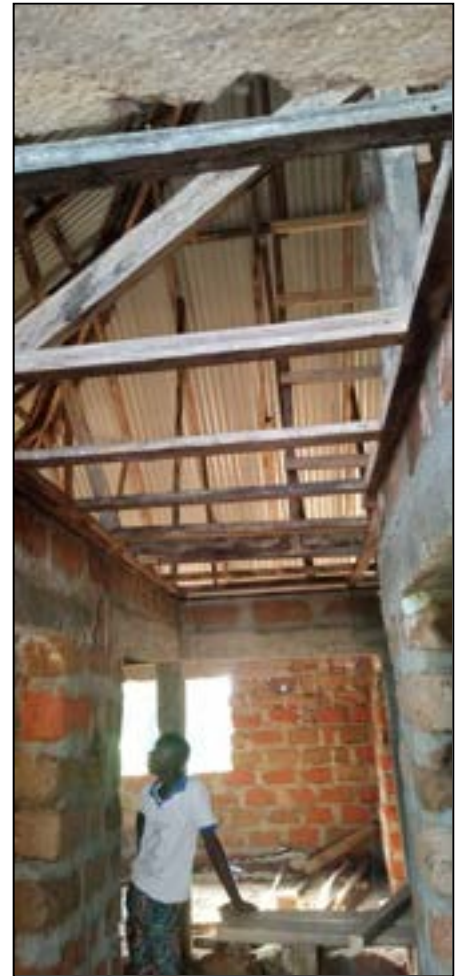
Installing ceiling tiles; we are praying the lodge is complete before November in order to house brethren, both local and international.